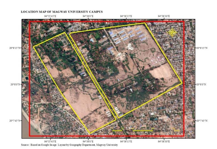
Fig 1:- Map Showing the Study Area

Status of the bird has been worked out and different status categories like resident, winter visitor, passage migrant, non-breeding visitor and breeding visitor have been assigned strictly with reference to the study area on the basis of presence or absence method [6].