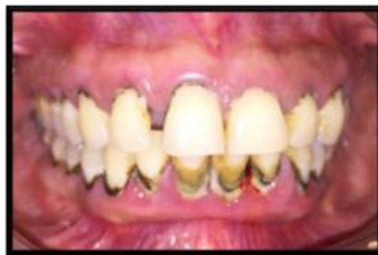
Fig 1:- Preoperative Intraoral View

Post-Operative Care : Periodontal dressing and suture removal was done after 10 days, surgical site was gently cleaned and irrigated with betadine iodine and normal saline solution. Charters brushing technique was reinforced in the region of surgical site. Patient was evaluated at the end of 1month,3month, 6 months. (FIGURE 8) No Periodontal probing was done during this period. Patient was re examined after 6 months of periodontal surgery which showed reduction in pocket probing depth upto 3mm, which was initaially 6mm and CAL from 7mm to 3mm.. (FIGURE 9) no signs of BOP i.e. bleeding on probing were seen. Also significant radiographic bone formation was visible in intrabony defect with mesial aspect of 47. (FIGURE 10)