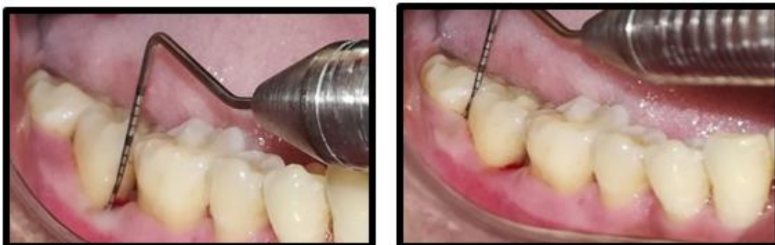
Fig 9:- Postoperative Probing Depth Assesment.