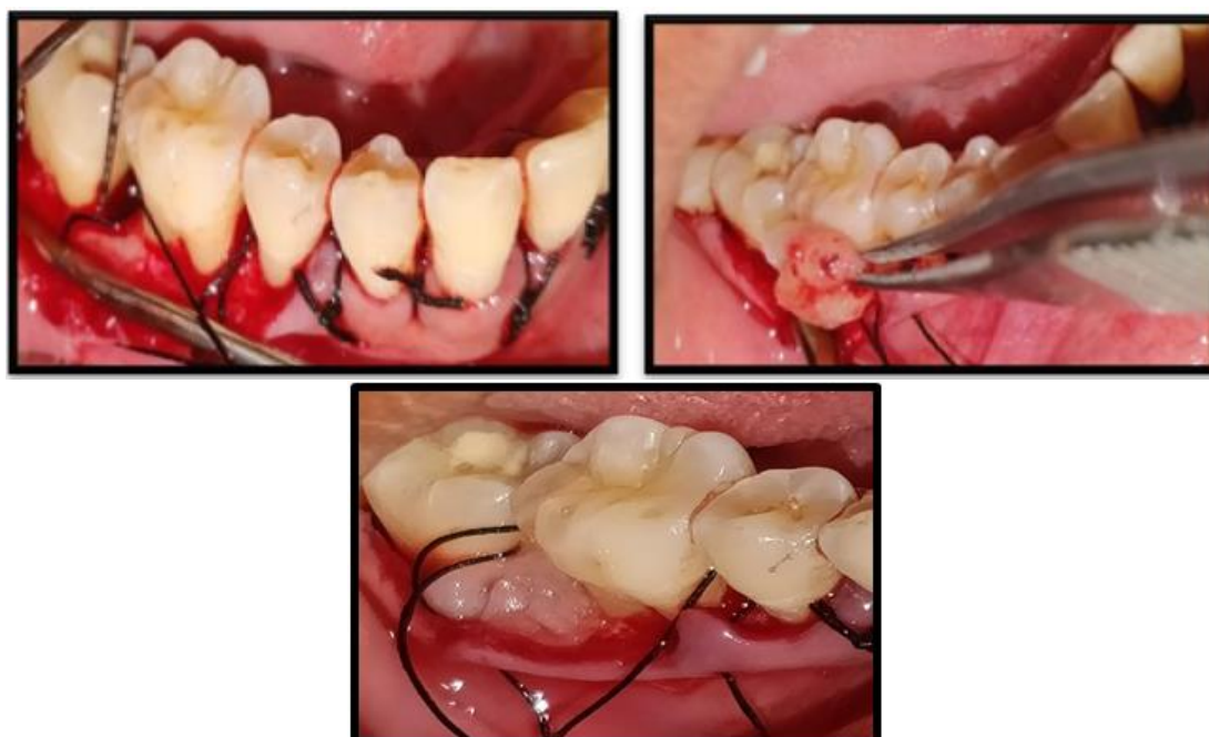
Fig 6:- Presuturing and Placement of PRF in Intrabony Defect