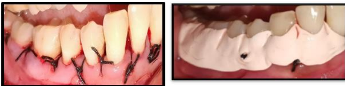
Fig 7:- Sutures in Place and Periodontal Dressing Given.