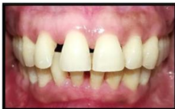
Fig 8:- Postoperative Intraoral View After 6 Months