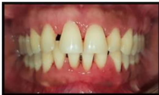
Fig 3:- 1 Week Intraoral View After Srp