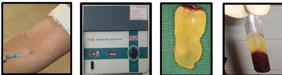
Fig 5:- Platelet Rich Fibrin Preparation