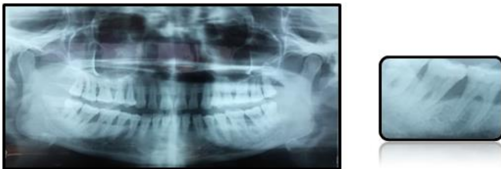
Fig 2:- Preoperative OPG & Preoperative IOPA C 47