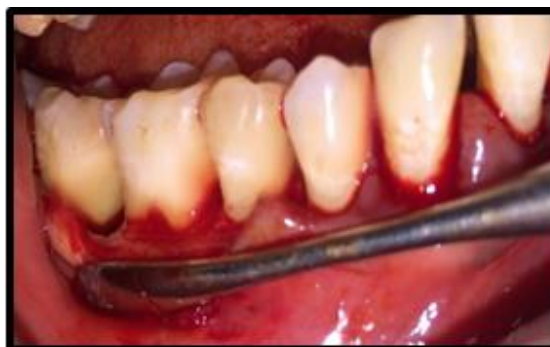
Fig 4:- Full Thickness Mucoperiosteal Flap Reflection With 42-47