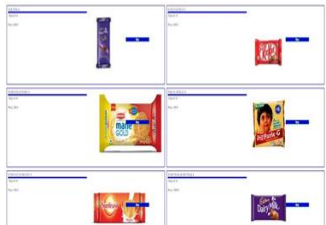
Fig 6:- Products recommended

The obtained features are used to recommend the products to the user.