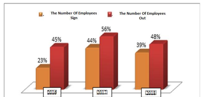
Fig 1:- Data Turnover Employees Division Sales PT XYZ Distribution in West Jakarta 2016-2018

The existence of human resources contributes and influences the company's competitive success. And the existence of reliable human resources has a very important role too. Aware will importance of human resources for the survival and progress of a company then a company should give special attention to this aspect. One problem that affects the workforce in a company is the high turnover rate. For example, the sales employee of PT. XYZ distribution in West Jakarta has a fluctuating turnover intention in 2016-2018.