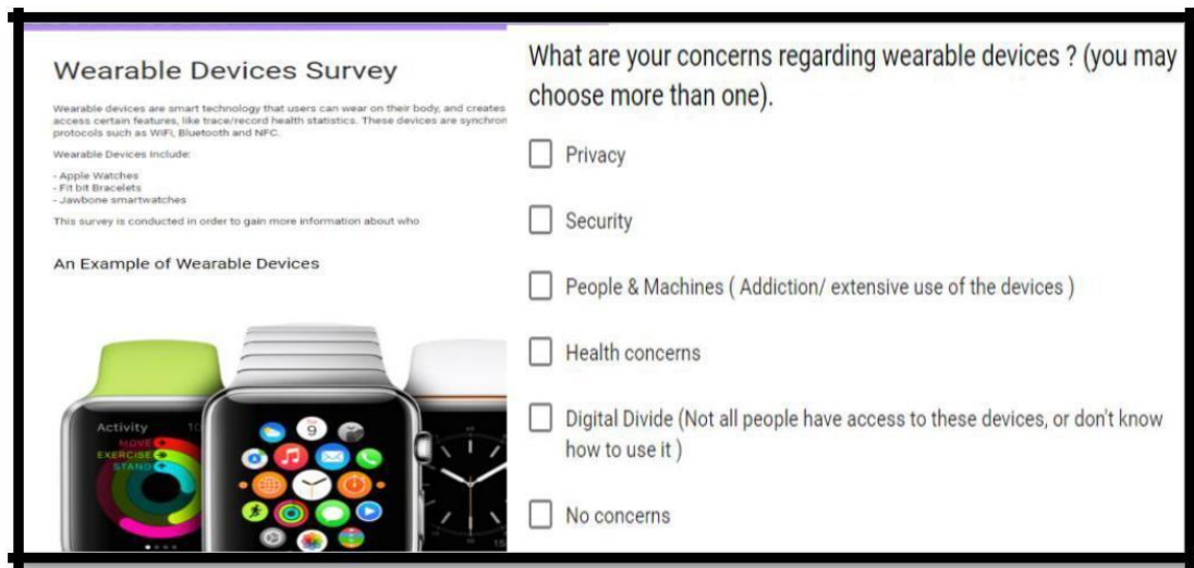
Figure 1: image showing a sample of the survey that was given to different students in the school