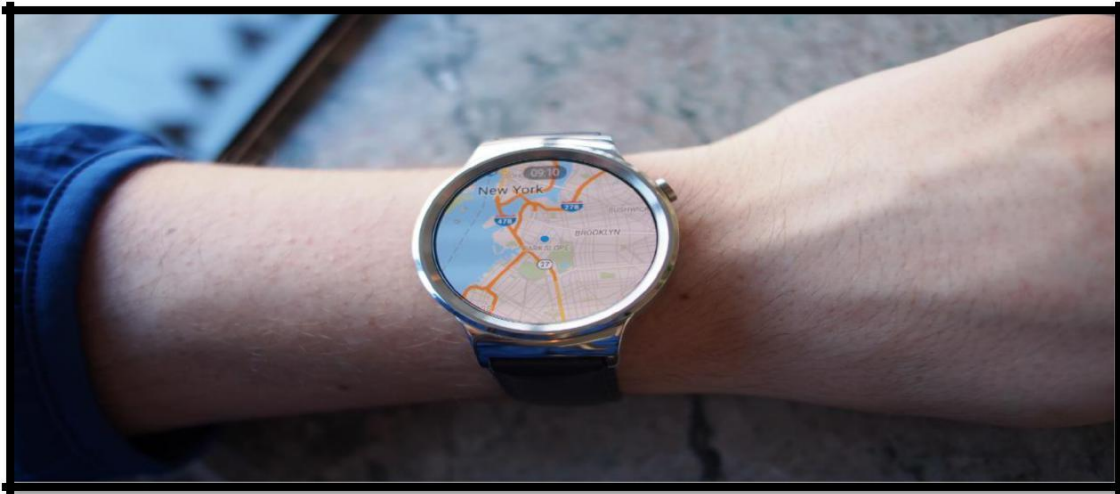
Figure 3: Image above shows Google Maps running on an Android Wear powered Smartwatch. In this case, the Huawei Watch. 3

One of the main features that have been constantly advertised by many of the companies responsible for the fitness trackers many use today is the ability of these wearables. These devices track locations such as running and cycling routes, as well as a mini-GPS unit. That allows users to get step-by-step navigation (as seen done on Android Wear Watches using the Google Maps application)