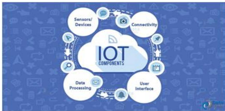
Fig 1:- Overview of IOT

individuals rely upon the farming. Indian water system framework the famers are picked the greater part of the strategies physically, for example, trickle, terraced, dump water system arrangement of them [1-5]. So as to improve to the crop efficiency there is a need to change manual strategy to automation [6]. Additionally consider the water accessibility all through India it is one of the important assets to secure and put something aside for future needs. As the world is drifting towards new advancements and executions it is a fundamental objective to slant up in agriculture as well. Numerous investigates are done in the field of agriculture and the vast majority of them signify the utilization of wireless sensor to organize the gather information from various sensors to different hubs and send it through the remote convention. Subsequently, this paper deals about creating smart agriculture utilizing IoT and given to the farmers. Inserted based programmed water system framework is appropriate for farmers accessible requiring little to no effort effectively introduce [7].