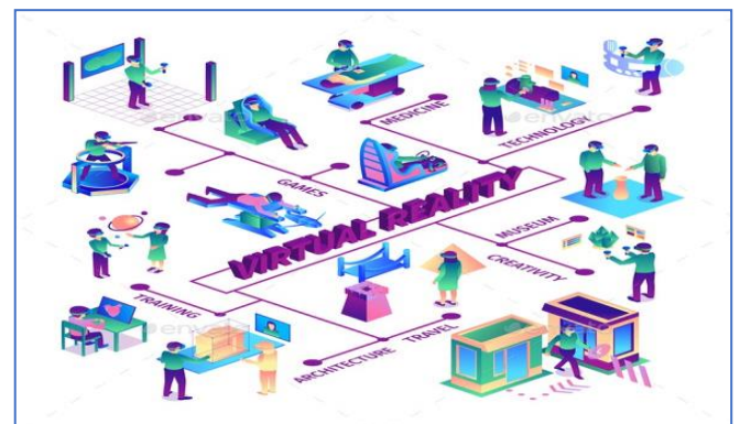
Fig 1:- Virtual Reality

utilizing an omnidirectional camera or an assortment of cameras. During playback on typical level presentation the watcher has control of the review bearing like a display. It can likewise be played on a showcases or projectors organized in a circle or some piece of a circle.