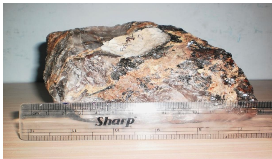
Fig 2:- Photograph showing hollandite, rhodonite and winchite in gondite rock