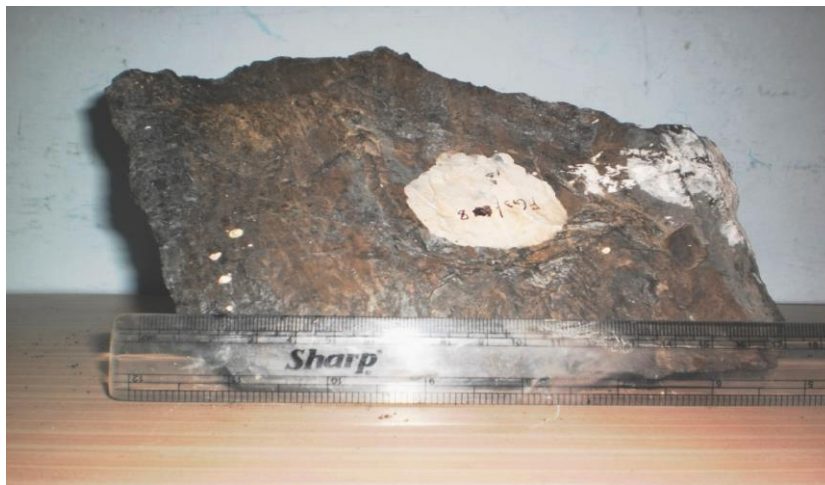
Fig 4:- Photograph showing micro folding in Gondite with manganese ore.