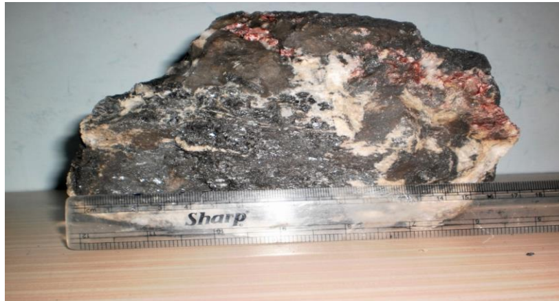
Fig 3:- Photograph showing braunite in Gondite with quartz, mica, schist.