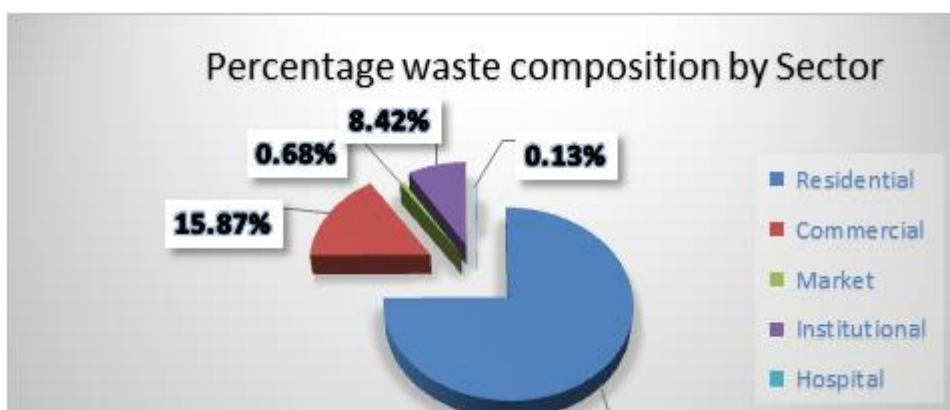
Fig 3:- Percentage Waste Composition by Sector

The total waste composition by sector was shown in the figure below. The highest generated waste was coming from residential with 74.92% followed by the commercial with 15.87%, institutional with 8.42 %, market with 0.68 % and from hospital with 0.13%.