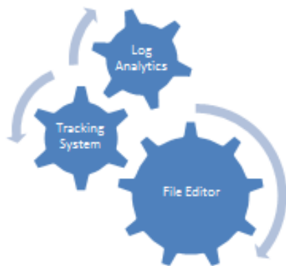
Fig 2:- Packaged System

As per the functionalities identified the system will have 3 integrated sub-systems for file editing, tracking and log analytics which is represented in [fig-2].