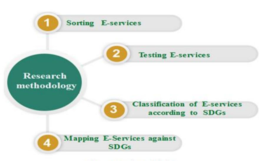
Fig 3:- Research Methodology

As the scope of this research is E-government services and SDGs in Egypt. Therefore, e-services in Egypt will be displayed, sorted and tested, then classified according to SDGs, Then E-services will be linked to SDGs to derive an assessment matrix Egyptian E-government Service Parameters towards achieving SDGs and targets (as shown in ).