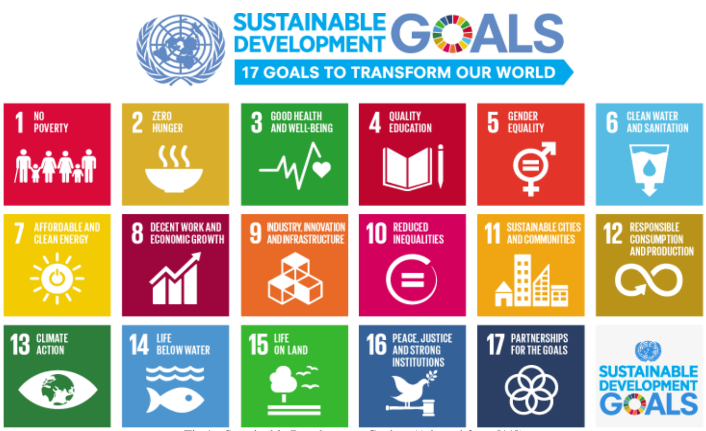
Fig 1:- Sustainable Development Goals – (Adapted from [11])

The SDGs comprise a new broad range of economic, social and environmental( as shown in Fig 2:-Classification by domains- below ) objectives that universally apply to all, and over the next fifteen years countries will mobilize efforts to end all forms of poverty, fight inequalities and tackle climate change while ensuring that no one is left behind.