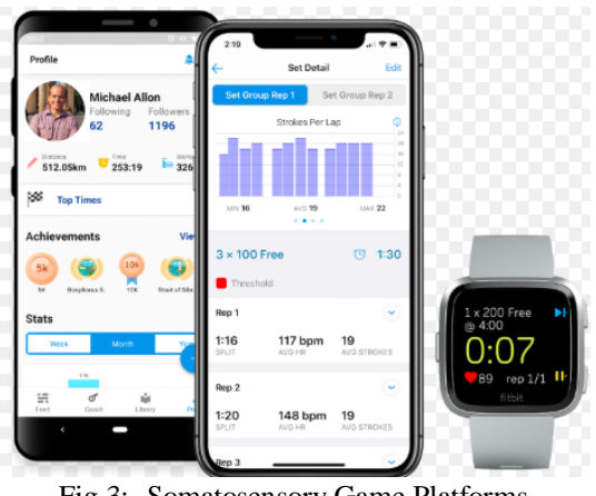
Fig 3:- Somatosensory Game Platforms

Similar to human eyes subconsciously focusing on moving objects, Kinect will automatically find moving objects in the image that are more likely to be the human bodies, and then perform pixel-level evaluation of the depth of field image to identify different parts of the human body. In this process, the system uses an optimization algorithm to shorten the response time, uses a segmentation strategy to distinguish the human body from the background environment, and extracts useful signals from the noise. Kinect can actively track up to two players, or passively track the body and position of up to four players. At this stage, the system creates a mask in the depth-of-field image for each tracked human body, and removes background objects (such as chairs and furniture). In the figure 3, we present the platforms [16].