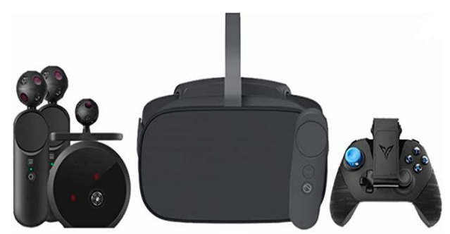
Fig 2:- Devices Used for the Mentioned Technology

Somatosensory technology has only been a few years since its popularization, but it has been quite fruitful in both technology and application. Based on the collation of existing related literature, the research on realization of somatosensory technology mainly focuses on the exploration of the sensing depth and accuracy. In the figure 2, we present the devices for the mentioned technology [12-15].