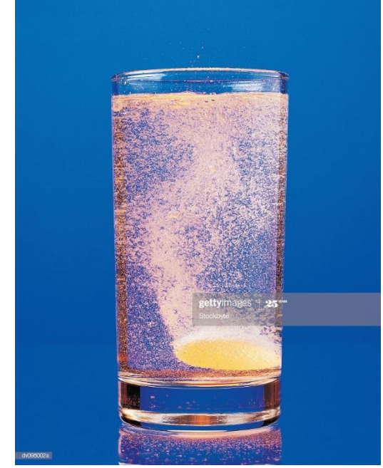
Fig 1:- Effervescent tablet in glass of water shows the effervescence.