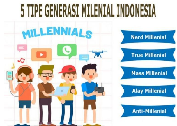
Fig 2:- Five Types of Indonesian Millennial Generation

Based on a national research conducted by Alvara Research Center in early 2018 where this survey was conducted on 2,200 respondents throughout Indonesia with an age range between 15-39 years there are five types of Indonesian millennial generation as follows: (1) Millennial Nerd of 7.4 % (2) True Millennial as much as 22.7% (3) Mass Millennial as much as 41.8% (4) Alay Millennial as much as 9.3% (3) Anti-Millennial as much as 18.9%