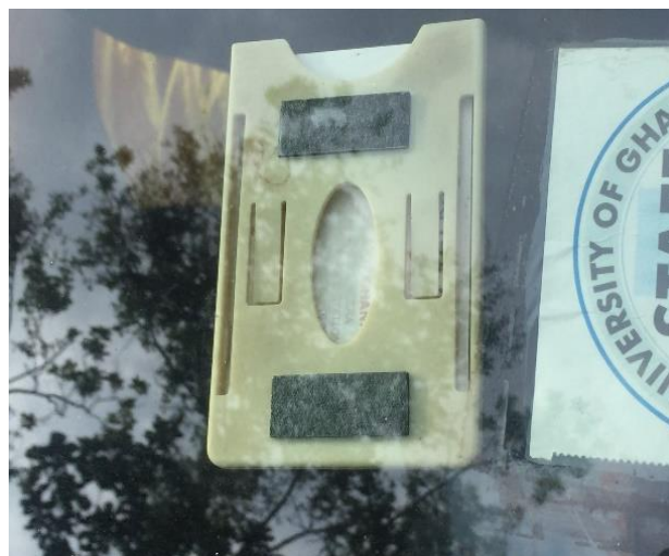
Fig 8:- Shows the University of Ghana vehicle Identification brand fixed on a car