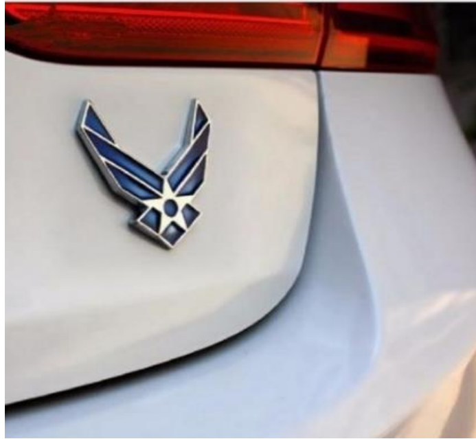
Fig 11:- Shows an air force Chrome metal emblem badge