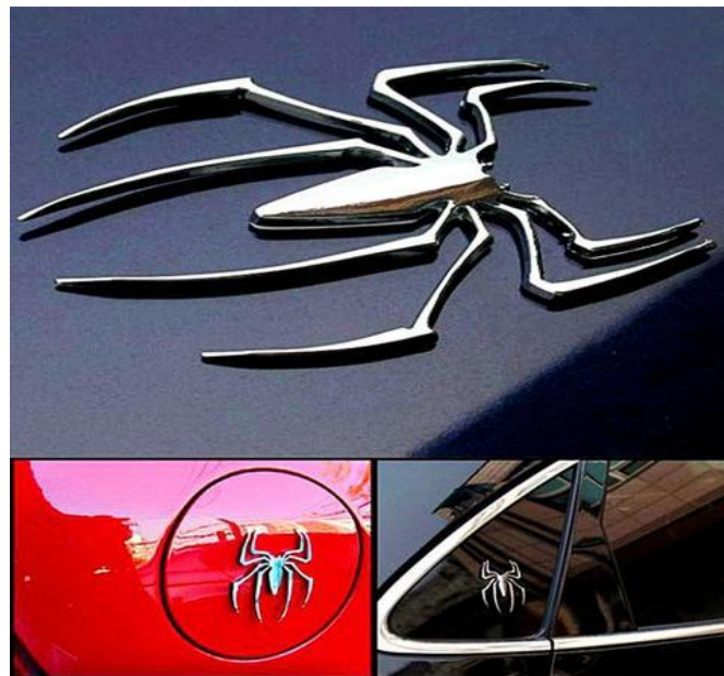
Fig 10:- Shows a 3D metal Spider sticker on a vehicle

The metal impression branding unlike the other methods, make use of a designed logo, emblem, any abstract or letters representing a company or institution in metal and with the help of any reliable adhesive material, fixed on the surface of an automobile. The metal identification for branding can be fixed from the bumper to the corner of a vehicle's windscreen. Metals that can be used for this branding method include brass, aluminum, zinc, lead, copper, nickel, iron, silver, stainless steel etc. these are well designed for the purpose of visibility and given a good finish to be able to be recognized from afar. examples are shown in figures 8, 9 and 10.