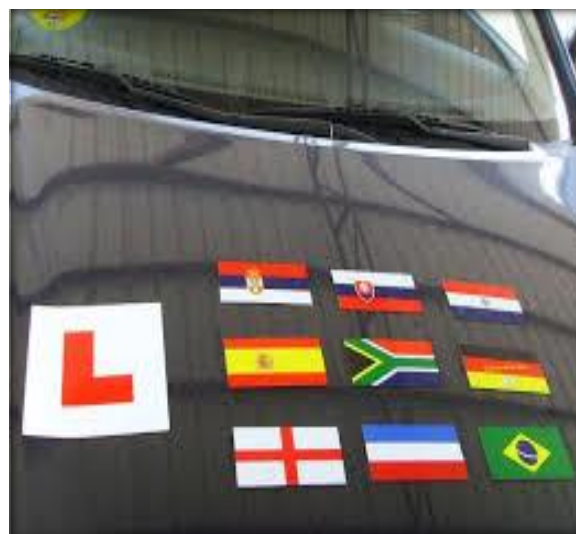
Fig 3:- Shows magnetic badges of some countries stuck to the bonnet of a vehicle

With this method of automobile branding, a designed logo, letters, emblem or a combination of an institution or an individual customized design is produced from either metal or plastic for the purpose of sticking onto a vehicle by a magnetic force. Looking at the figures 3 and 4, the back of the designed logo or emblem has a magnet or magnetic linen to attract and stick to steel bodies of vehicles. These may combine with adhesives to give a more permanent effect.