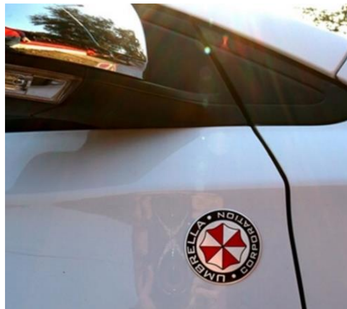
Fig 12:- Shows a 3D evil umbrella emblem badge on a corner of a on a vehicle car door

Modern metal impression branding is done in such a way that the branding (design for advertisement or recognition purposes) can be detached or changed due to the dynamic nature of the world or the changes of moment to suit present innovations and creativity. Like vinyl branding on vehicles that can be removed without leaving any stains on the surface pasted on, so can metal impression branding on vehicles be done. Whether the metal impression for the branding was glued to the bumper, doors or even to the windscreen, that strong adhesive used can be detached from the vehicle body.