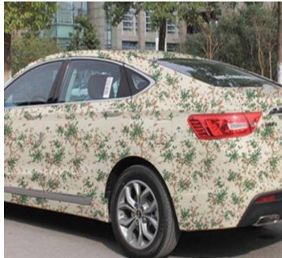
Fig 6:- Shows customized camouflage vinyl wrapped around a vehicle.