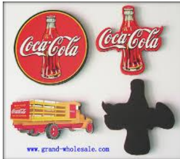
Fig 4:- Shows magnetic badges of Coca-Cola