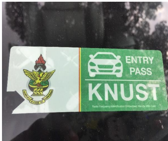
Fig 7:- Shows the KNUST vehicle identification Brand fixed on a widescreen of a vehicle