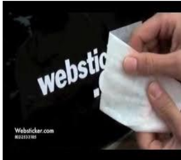
Fig 9:- Shows vinyl sticker design being transferred onto a vehicle surface

This style or method of vehicle branding is very common in the society nowadays due to the competitive markets. A vehicle either four wheel or three wheel is wrapped with the vinyl design and then wrapped on either the whole body of the vehicle or half wrapping. This style of branding is mostly done during promotions of company's products as it is very common in Ghana and other part of Africa. The product and the name of that company is designed and printed on a vinyl material as a means of easy display on vehicles