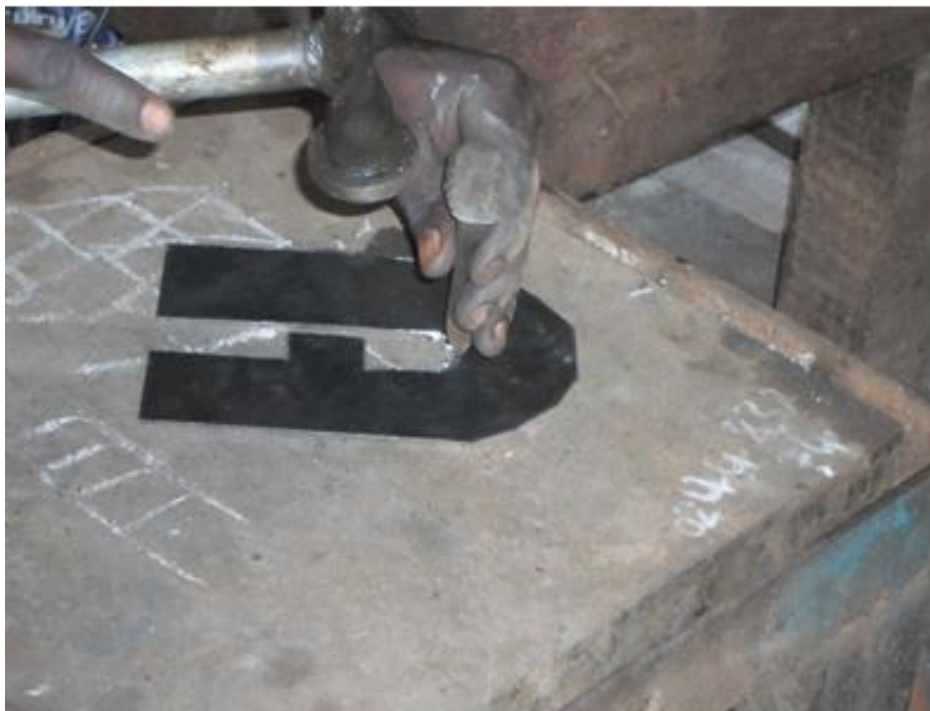
Fig 11:- Cold chiselling of the members