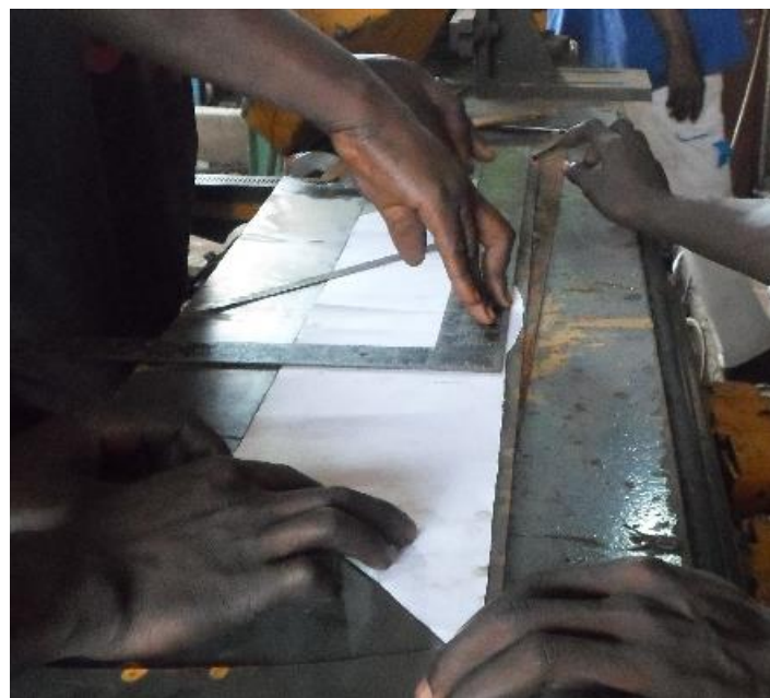
Fig 9:- Marking out on the mild steel sheet

The templates cut out were placed on the steel sheet and traced with a permanent marker as shown in Figure 9.