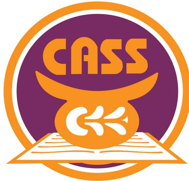
Fig 1:- Corel draw version of the selected logo

According to SCOTT(2013), steel is made up of carbon and iron, with more iron than carbon. In fact, at the most, steel can have about 2.1% carbon. Mild steel is one of the most commonly used construction materials. It is very strong and can be made from readily available natural materials. It is known as mild steel because of its relatively low carbon content. Regarding finishing, Farrow & Ball.com (2013), states that the best finishes for outdoor logos must be oil based. It must be beautiful to look at and must have superior performance. Pate (2013), however suggests the limitless application of metal finishes in a wide variety of areas by artists and technicians.