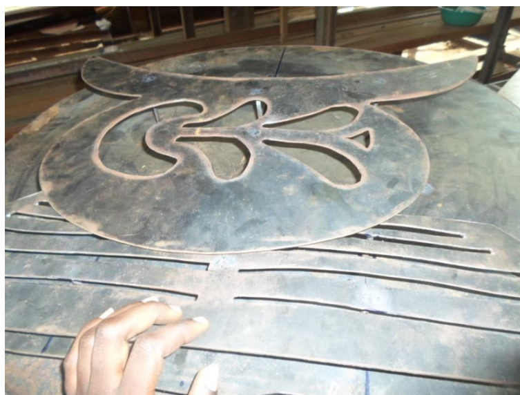
Fig 17:- A trial assemblage to ensure that all parts fit