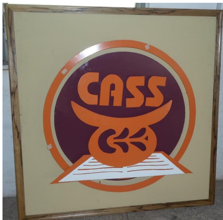
Fig 36:- The finished logo mounted on the mock wall