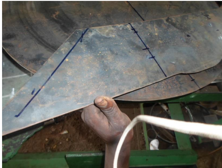
Fig 15:- Marking out of the book for the drilling of the holes.