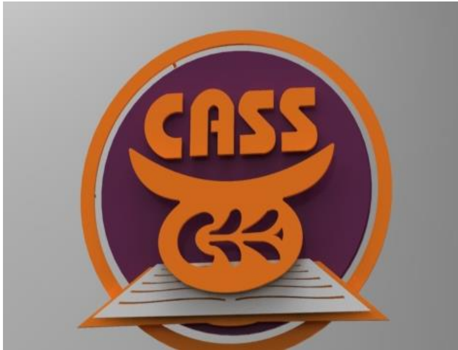
Fig 2:- Front view of the rhino model.