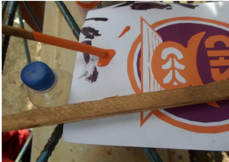
Fig 27:- the colour chart for the mixing of the paint