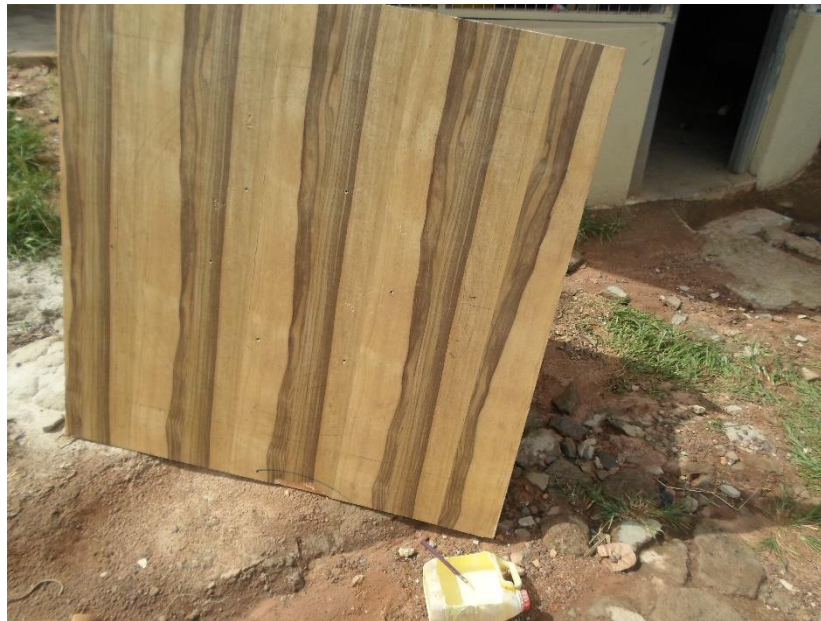
Fig 31:- Plywood for mounting of the logo

The surface of the 121.92 cm by 121.92 cm large plywood was prepared and painted three times with acrylic paint as shown in plates 31 to 35. The surface of the prepared board was marked out and holes were drilled to accommodate the connectors of the logo. The logo was fixed into the holes on the surface to serve as a substitute for the wall as in plate 36.