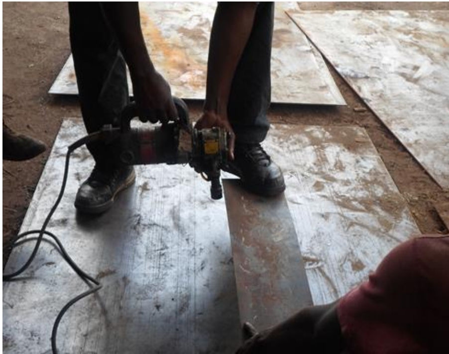
Fig 10:- Cutting with the hand steel cutter

A hand steel cutter, the hacksaw and the cold chisels were used to cut the different parts of the logo according to the templates as shown in figure 10, 11 and 12. The variations of the cutting devices were employed because of the differences in the sizes and curves of the different parts.