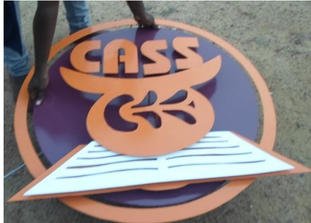
Fig 30:- Assembled logo

The components were assembled into the logo and Clare epoxy adhesive was employed to hold the joints in place. This was chosen to prevent discolouring of the joints. The assembled logo is shown in Plate 30.