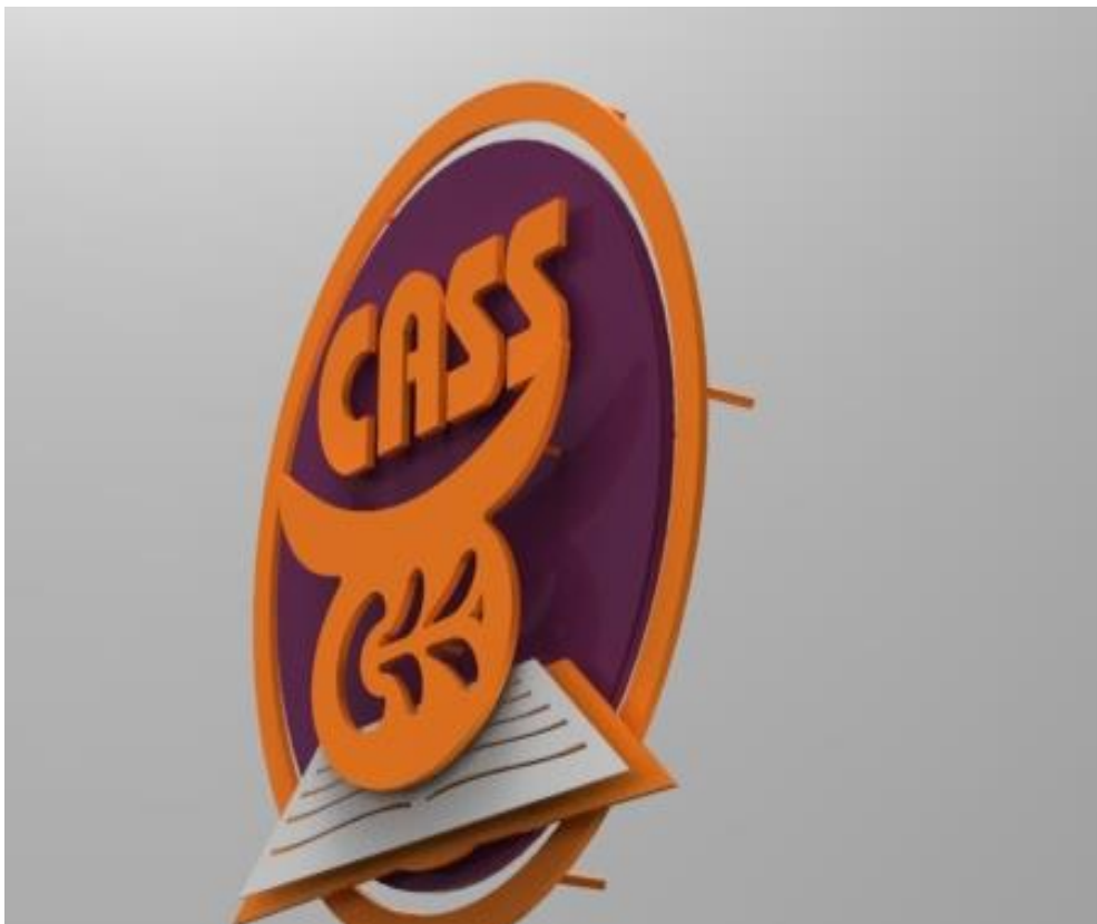
Fig 3:- A perspective view of the rhino model