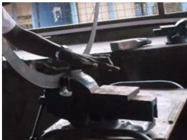
Fig 20:- Filing of the edges and pierced holes