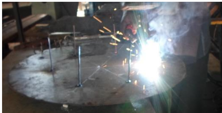
Fig 13:- Welding of the spokes to the back of the components

Spokes (1/4" iron rod) of 7cm, 10 cm and 20cm were cut and welded to the back of the components. As shown in Figure 13, the 20cm long spokes were welded to the back of the circle and the ring, whereas the 10cm spokes were welded to the back of the stool. The 7cm long spokes were welded to the back of the letters and the book. The results for the CASS letters of this process are shown in Figure 14.