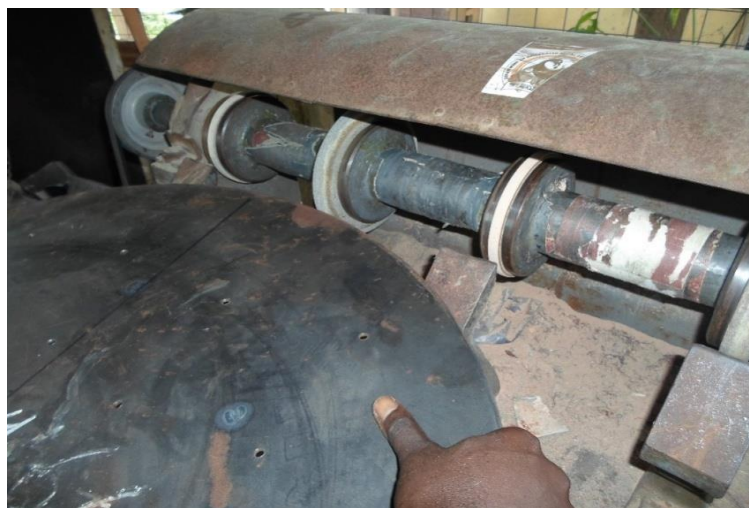
Fig 19:- Grinding of the components' edges to straighten them

All the components of the logo were grinded and filed to smoothen all edges and to precision as shown in figure 19 and 20. The grinding was also done to make the edges safe for use.