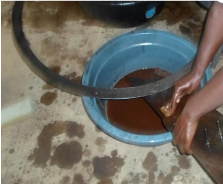
Fig 21:- Washing of components with diesel and abrasive paper to remove rust

Due to the fact the mild steel had rusted over the process, the individual components were washed thoroughly with diesel to remove the rust as shown in figure 21. These components were scrubbed clean with a scratch brush and abrasive paper to rid it of all rust.