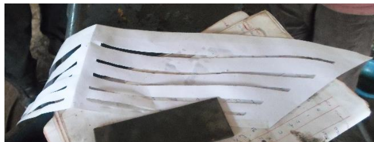
Fig 8:- Cut out template of the book