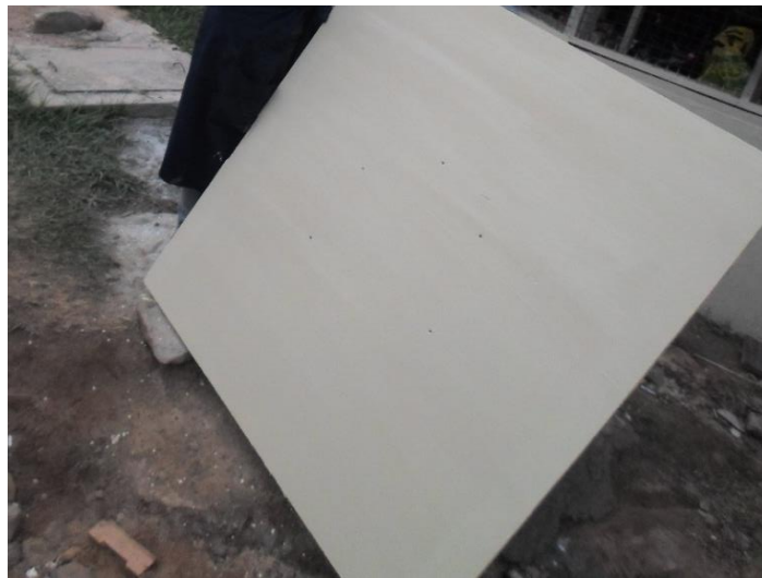
Fig 34:- Finished board ready for mounting.