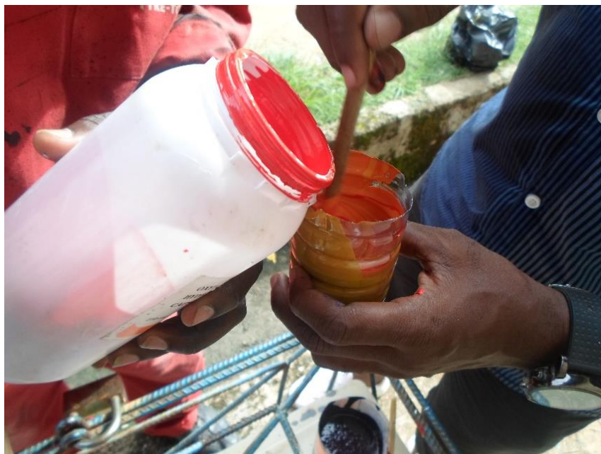
Fig 26:- mixing of the auto- based paint for spraying.

The primed and sanded parts as shown in figure 25 were sprayed with enamel paint mixed to the colours of the logo as shown in figure 26. The colour mixing was done prior to the spraying with the aid of a coloured print of the logo in figure 27. The white surface was sprayed first, followed by the orange colour, then the violet. The brighter colours were sprayed first and stored to prevent the destruction of the hue since just one spraying barrel was used. This was done three times each and allowed to dry after each spraying. Some of the sprayed surfaces are shown in figures 28 and 29.