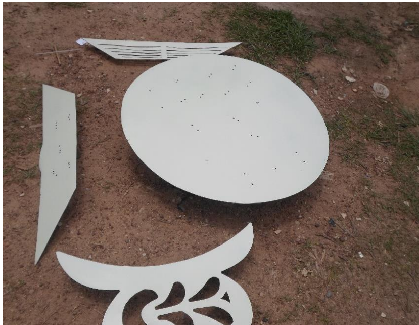
Fig 25:- Primed surfaces.