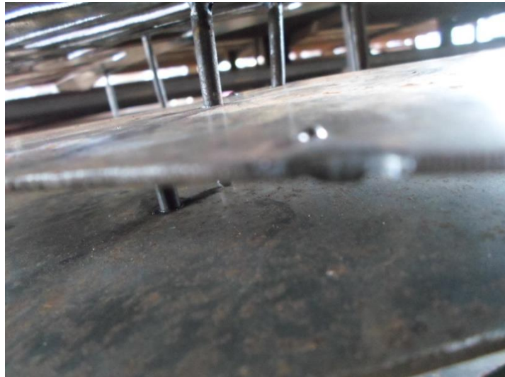
Fig 18:- View of the parts after assemblage