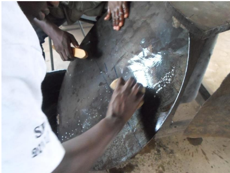
Fig 22:- Washing of the surface to remove oil residue from the anti-rust treatment.

The components were washed with a foam and detergent to clear of all oil residue deposited on the surface of the metal as shown in figure 22. The result of this is shown in figure 23.