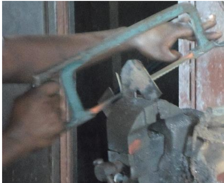
Fig 12:- Sawing with the hacksaw