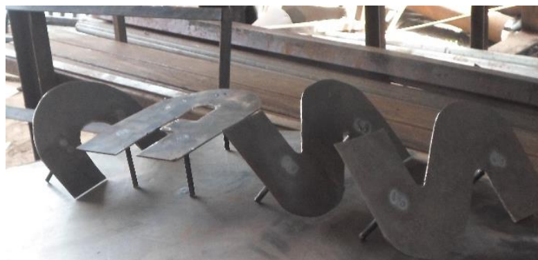
Fig 14:- Components with the spokes welded to the back

The parts were then aligned and the points where the spokes must penetrate their respective surfaces were marked as shown in figure 15 and 16. The hole were then drilled to accommodate the connectors (spokes). The parts were test assembled (figure 17) with respective parts: 4 cm above their respective surfaces as shown in figure 18.