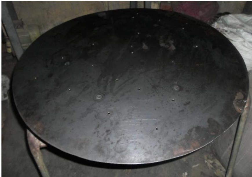
Fig 23:- The surface of the sheet after the anti-rust treatment