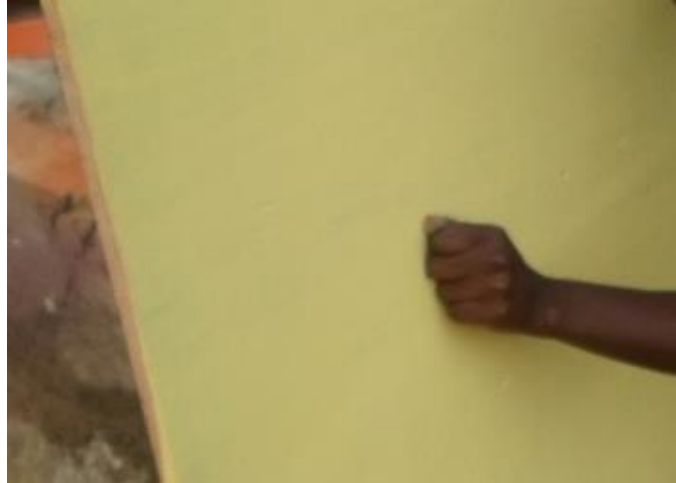
Fig 33:- Sanding of the first and second acrylic surface for the final coating