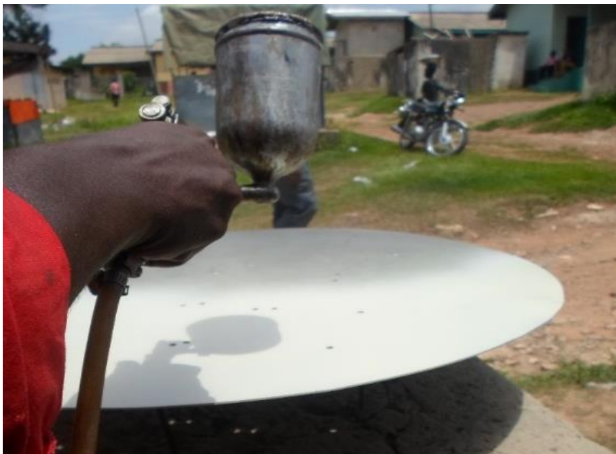
Fig 24:- Priming of the surface.

The surfaces of the members were sprayed with a primer to prepare them for the colour treatment as shown in figure 24. The priming was done and the surfaces were sanded three times to ensure a smooth and levelled finish. The surfaces of the metal sheets were wiped clean and dried in the sun to make way for spraying.