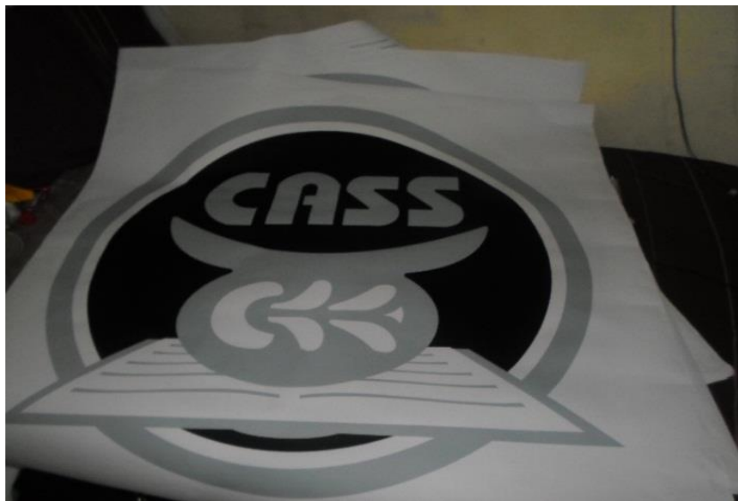
Fig 5:- The life size of the logo, 3ft x 3ft.