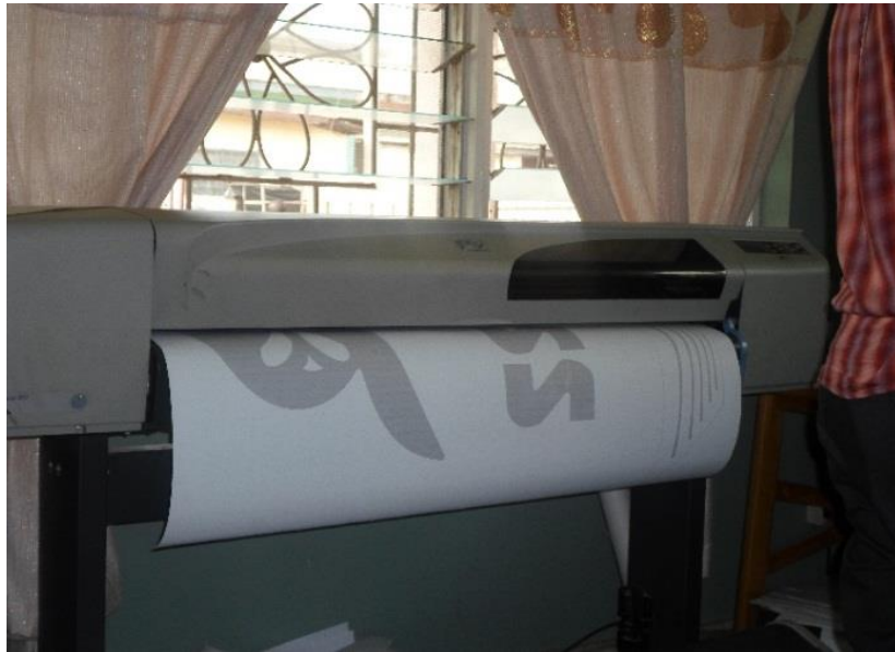
Fig 4:- Life-size printing of the components of the logo.