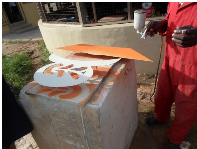
Fig 28:- Spraying of the surfaces