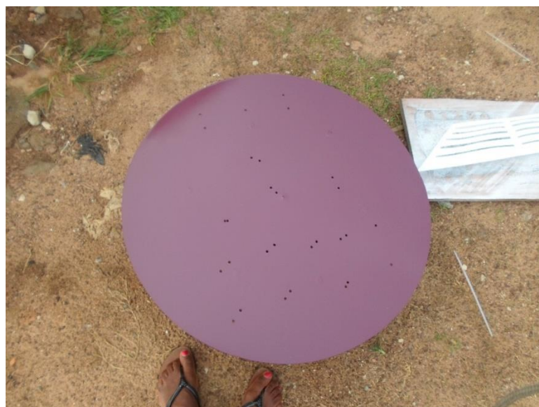
Fig 29:- Some sprayed surfaces