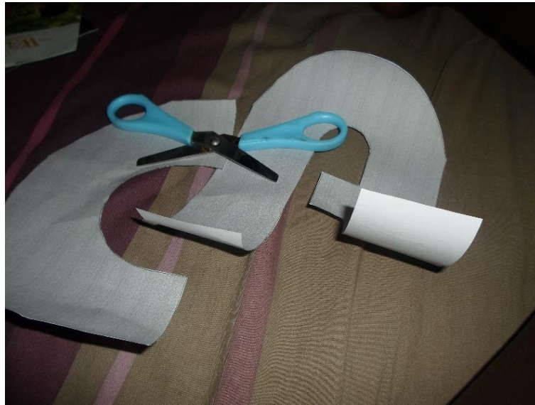
Fig 7:- Some cut-out templates.