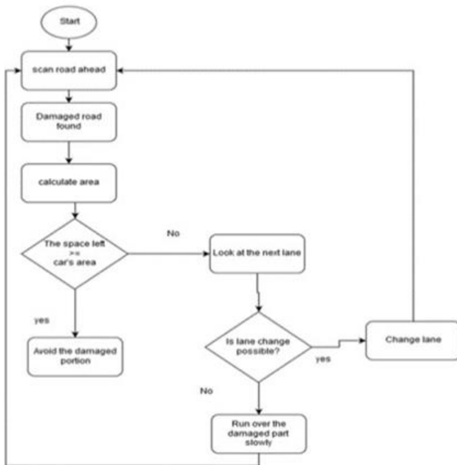
Fig 2:- Damaged Road Avoidance

The car will deal with broken roads by using any combinations of total avoidance and/or slow run over in damaged streets. The car will first detect a damaged area by using its front camera(s) and its infrared and Sonar capabilities. Once detected, the car will make a virtual rectangle of the damaged part so that the rectangle contains the damaged portion in its vicinity. The car will then calculate the amount of space left in its current lane, if there's enough space for it to move through, the car will simply avoid the potholes [14]. If it's not the case, there are two possible outcomes [13]. The car will either change its lane or run over the area with causing as fewer damages possible by slowing down its speed.