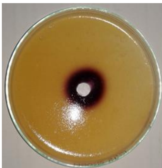
E. coli Formulation. 04