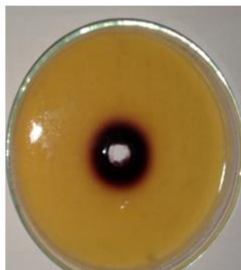
Staphylococci Formulation. 03