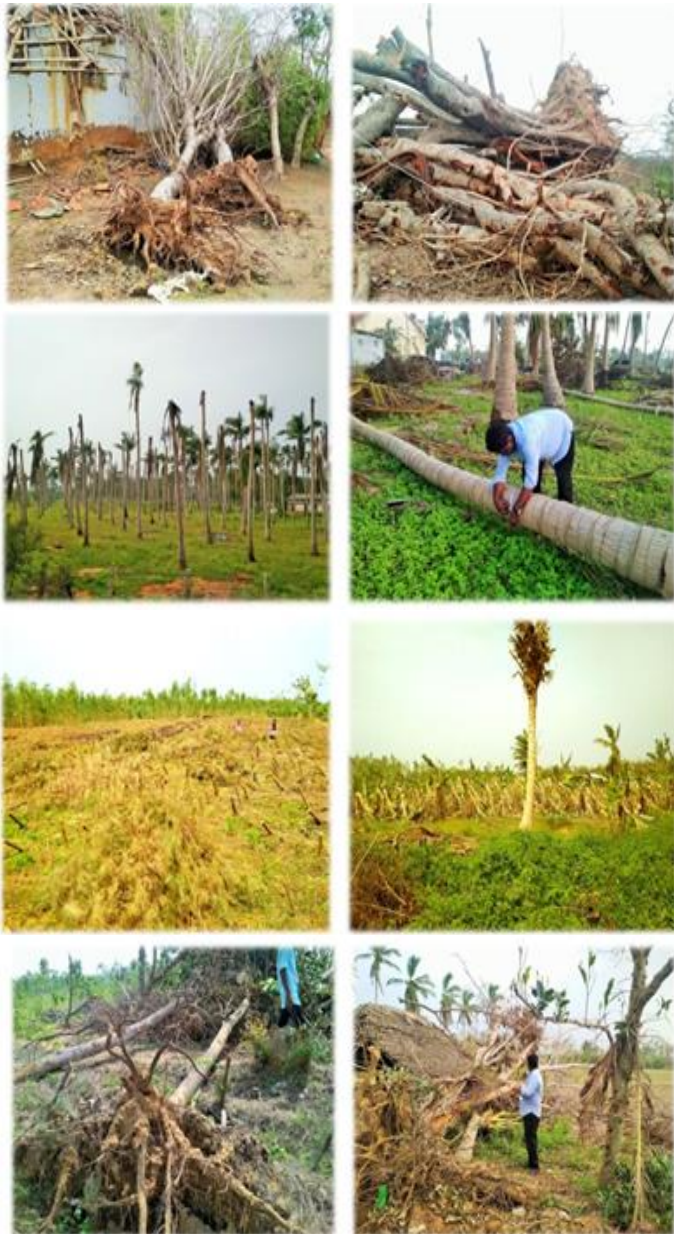
Fig 3:- Tress affected by Gaja