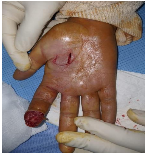
Fig 4 :- second step of the lambeau thenar.