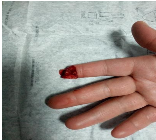
Fig 1 :- traumatic disrepair of the index finger.