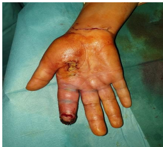
Fig 6 :- flap weaning after 2 weeks.