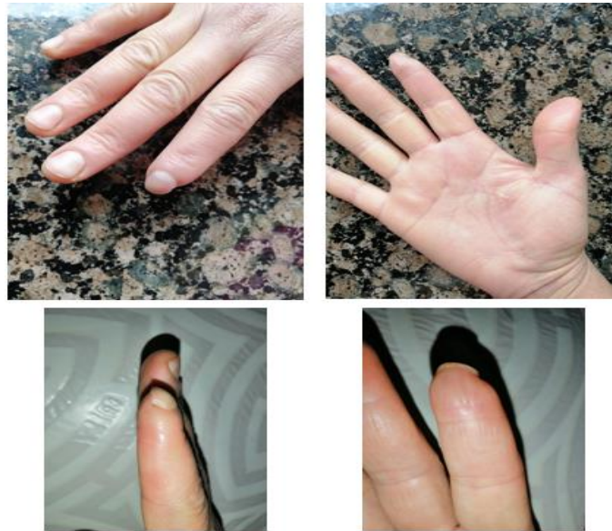
Fig 7 :- results after 6 months.