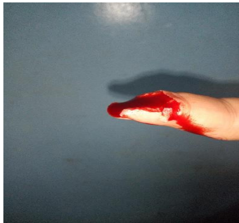
Fig 2 :- the depth of the trauma on a side view.