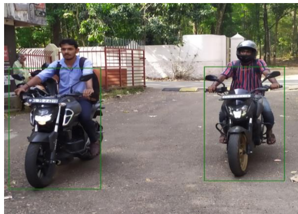
Fig 2:- Detection of Bike

The results obtained are shown as Figures below.