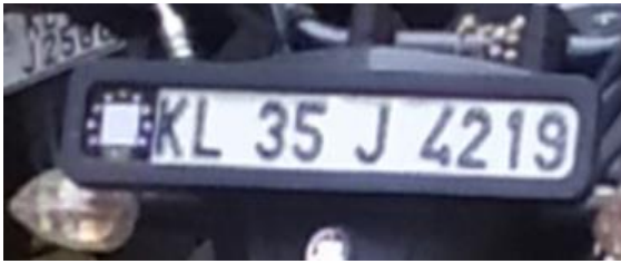
Fig 4:- Cropped Number Plate

The main part of the system, that is the detection of helmetless riders are shown in Figure 3. Here the head with the helmet is highlighted with blue boxes and that of the head with no helmet is highlighted using red boxes.