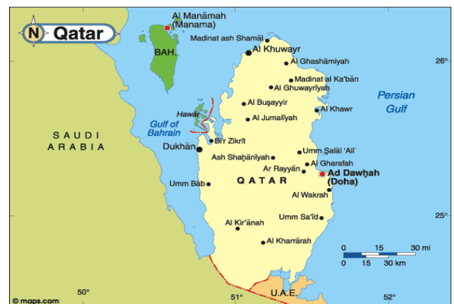
Figure 1: Map of Qatar

The study was conducted at the Philippine School Doha (PSD), founded in October 1992 in the State of Qatar.