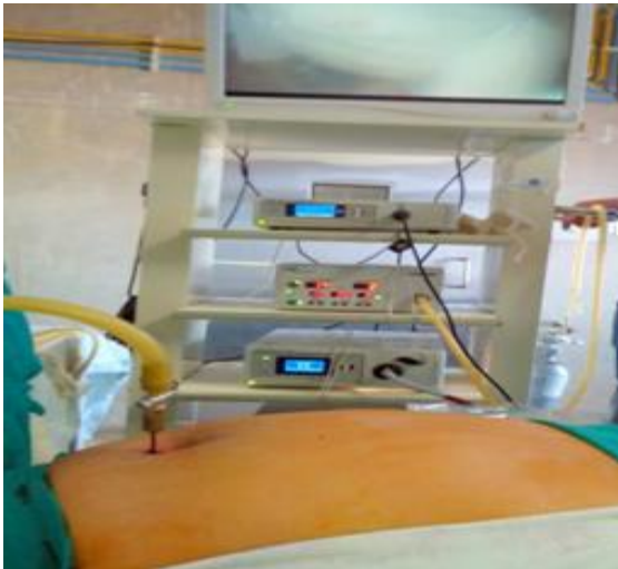
Fig.1: Showing pneumoperitoneum by Verres's needle at constant pressure of 14mmHg.