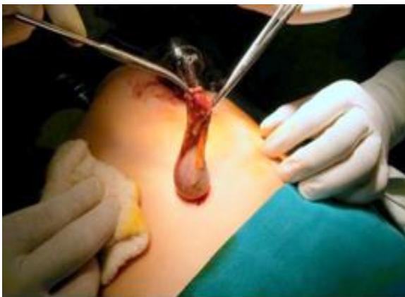
Fig.2: Gall bladder removed from epigastric port after laparoscopic surgery.