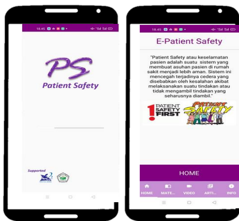
Fig 3:- Final Product of E-Patient Safety Application

The results of the final development of the application of media dissemination for patient safety goals. (See figure 3).