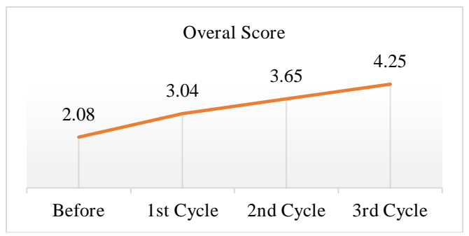
Chart 4:- Overall Teacher Work Discipline Score

The average achievement of teacher work discipline as a whole has also increased, as shown in chart 4.