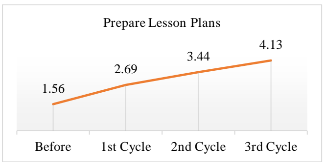
Chart 3:- Teacher Work Discipline Score's in the Aspects of Prepare Lesson Plans

Table 2 also provides information on the achievement of teacher work discipline in the aspects of prepare lesson plans. The score reached before the action was 1.56 (very low). After the application of the "Among" leadership model, the mean score achieved in the first cycle rose to 2.69 (medium), increased again in the second cycle to 3.44 (high), and increased again in the third cycle to 4.13 (high). This means that the discipline of teacher work in the aspect of prepare lesson plans tends to continue to increase, as shown in chart 3.