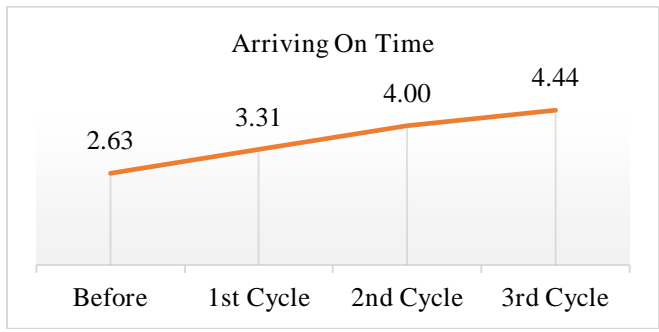
Chart 1:- Teacher Work Discipline Score's in the Aspects of Arriving on Time

Table 2 provides information that the mean achievement of teacher work discipline in the aspect of arriving on time before the action is 2.63 (low). When observed after the application of the "Among" leadership model, the mean score of the aspect of arriving on time in the first cycle increased to 3.31 (medium), increased again in the second cycle to 4.00 (high), and again increased in the third cycle to 4.44. (very high). This means that the discipline of teacher work in the aspect of arriving on time has an increasing trend. As shown in the chart 1.