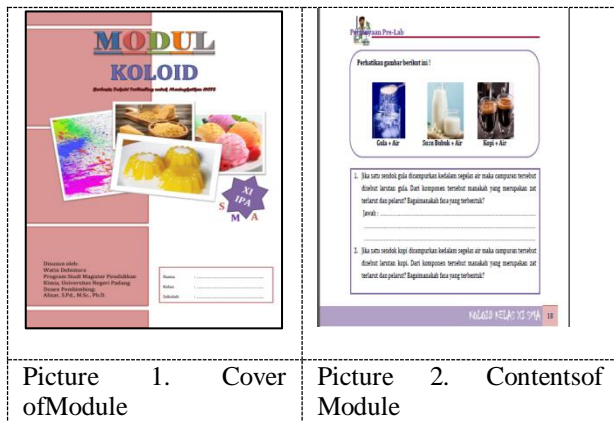
Picture 1. Cover of Module

be included in the guided inquiry module. Following are some views of the module components, see figures 1 and 2.