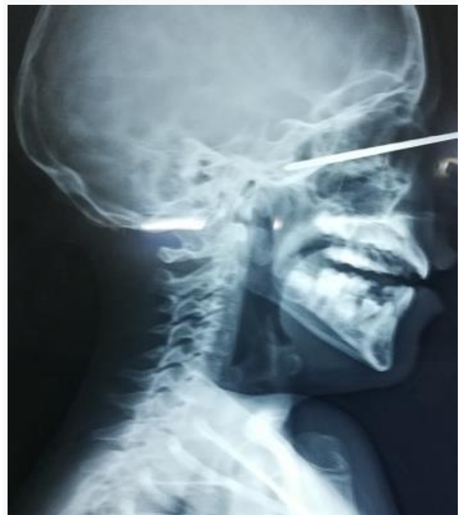
Fig 2:- standard x-ray of the skull, profile view