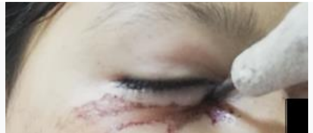
Fig 1:- picture showing the impact point of the Screwdriver