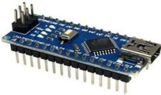
Fig 2. Photograph of Arduino NANO types

NANO Board, so power can be supplied using USB Cable.