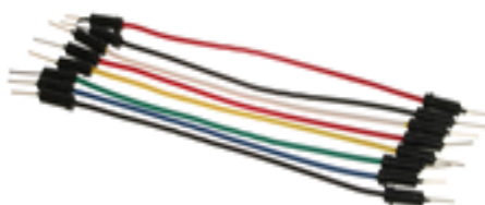
Fig.5: Connecting Wires

Connecting wires play a impotent role by providing a path to an electrical current to travel from one point on a circuit to another. In computers, wires are embedded into circuit boards to carry pulses of electricity.