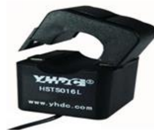
Fig 3. Hall effort sensor

A Hall effect sensor is a device whose major function is to measure the magnitude of a magnetic field. The output power sources (voltage) of the Hall effect sensor are directly proportional to the magnetic field strength through it. In the switching power supply Hall's current power plays a major role in current protection. Hall effect sensors consist of a magnetic core, a Hall effect device, and also signal conditioning circuitry. The sensor works when the current passing conductor is placed through a magnetically permeable core that concentrates the conductor's magnetic field.