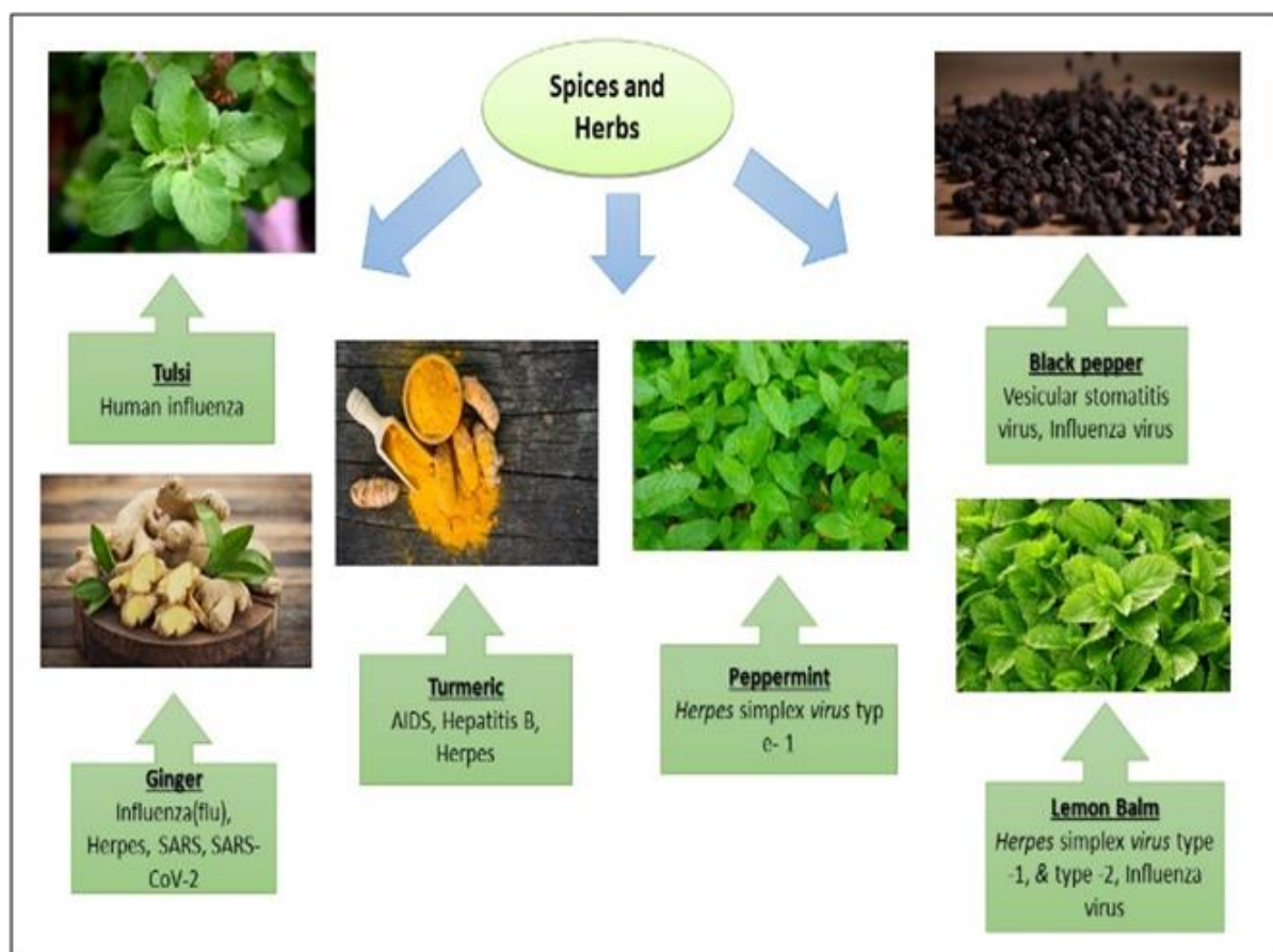
Fig 1:- Common spices and herbs with antiviral properties