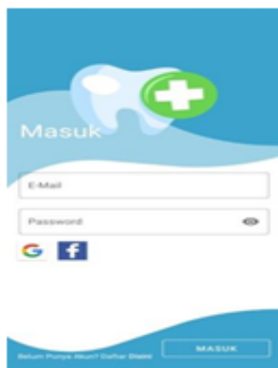
Fig 2:- Log In