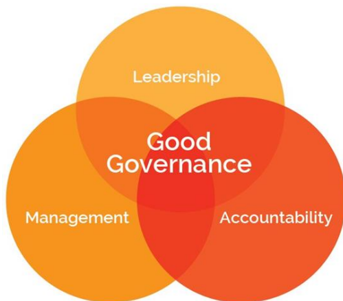
Good Governance in an organisation.

It seem today that in intercontinental expansion, good governance is a way of measuring how public organizations conduct public affairs and manage public resources in a preferred way.