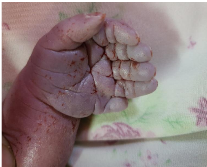
Figure 4: Polydactylie sur les 4 segments distaux