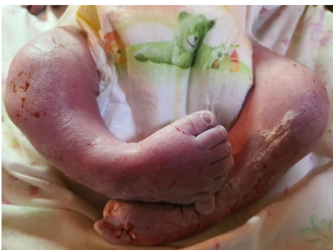
Figure 5: Aspect de pieds bots avec polydactylie