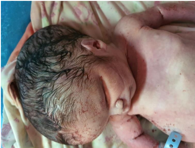
Figure 3: Aspect de rétrognatisme neonatal