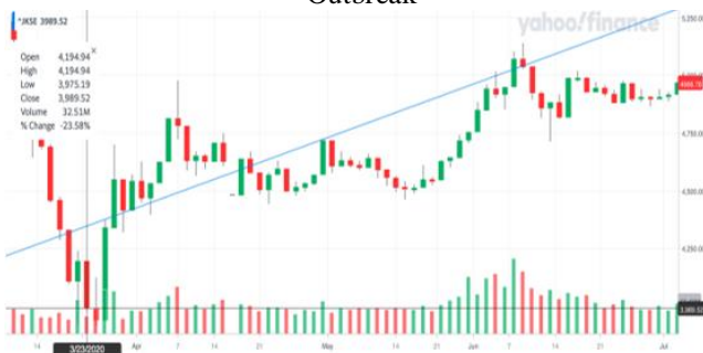
Figure 1. Investor Sentiment Against the Covid-19 Virus Outbreak

The Composite Stock Price Index has experienced fluctuations which are thought to be caused by positive sentiment towards the announcement of the results of the 2019-2024 Presidential Election. As reported on the tribunjogja.com website, the Composite Stock Price Index moved positively by 44.25 points (0.74%) to the level of 5,951.37. Meanwhile, the regional stock market did not experience positive sentiment towards the results of the 2014 – 2019 Presidential Election. In other conditions, the regional stock market experienced a weakening because there was no sentiment towards the results of the presidential election in Indonesia.