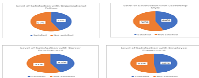
FIGURE 1. PRE-SURVEY OF ORGANIZATIONAL CULTURE SATISFACTION, LEADERSHIP STYLE, CAREER DEVELOPMENT, AND EMPLOYEE ENGAGEMENT

Based on the results of interviews conducted to the cement company's HR team, the researchers conducted a pre-survey regarding the factors considered to affect employee engagement to 30 respondents. The results of the pre-survey, namely organizational culture, leadership style and career development are the factors thought to have the most influence on employee engagement. The results of the pre-survey are presented in the image below: