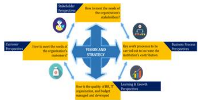
Fig. 1. Balanced Scorecard Model at BNN RI

The performance management model based on the Balanced Scorecard used at BNN RI is shown in Figure 1.