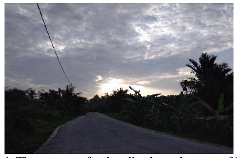
Figure 4. There are no food stalls along the way of Muntei Village

Food stalls are not yet available in Muntei Village. Figure 4 shows the atmosphere along the road where there are no food stalls visible. It is a weakness [12].