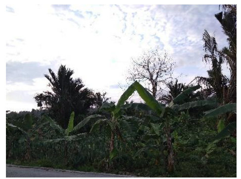
Figure 3. The natural environment of Muntei Village

The natural environment of Muntei Village is beautiful, the area is overgrown with plants. Most of tourists search for the environmental picturesque [10], [5]. The photograph of Muntei Village can be seen in Figure 3.