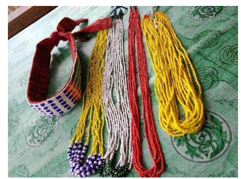
Figure 5. Handicrafts in Muntei Village

The typical food of Muntei Village is Subbet and Sago. However, there is no community that sells both types of food. The sign of the existence of Muntei Village is marked by the Village Gate. In addition, even villages are equipped with street names and directions to certain locations. There is no map of the location of the village to make it easier for tourists to reach the village. For the food and the direction, they are weaknesses [12].