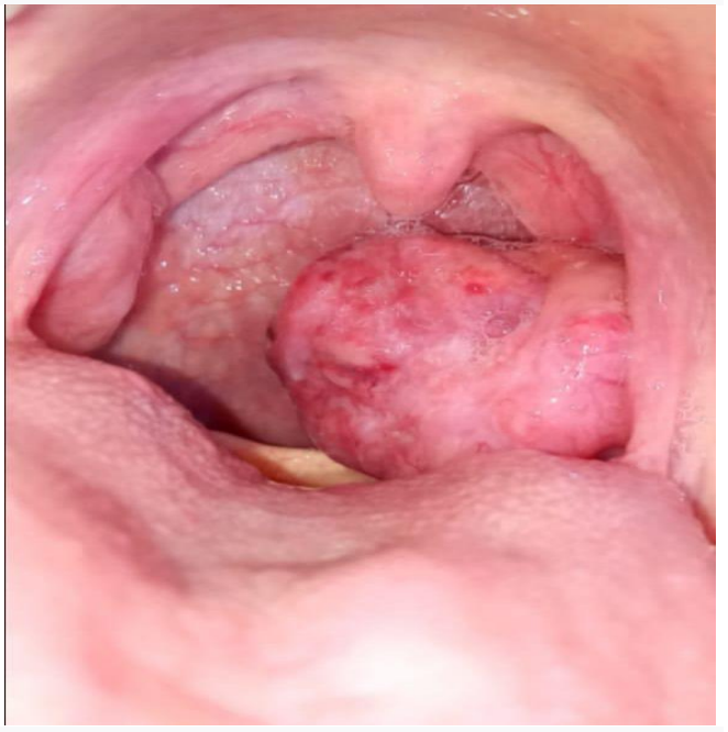
Figure1: clinical aspect of the left tonsil before chemotherapy

Consent for publication : The patient agreed that doctors could use and publish her case, including the accompanying pictures. A copy of the writing consents is available for review by the editor of this journal.