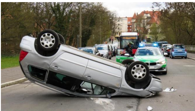
Fig 3. image frame with Dense traffic

Accident : 99.94832277297974 Sparse_Traffic : 0.04670554480981082 Fire : 0.004610423275153153 Dense_Traffic : 0.00035401615150476573