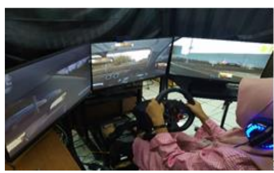
Fig 2. Driving Simulation

This study designed by using an experimental design, where the subjects were divided into two groups, namely the experimental group and the control group. The experimental group got a density level of 75% and the control group got a density of 50% as when driving normally.