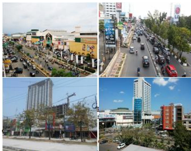
Figure 2. Visualization of Developments in Economic Facilities that affect changes in green open space in Panakkukang District