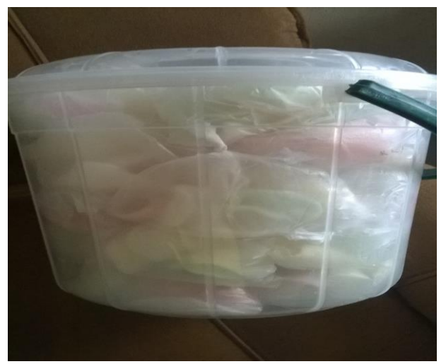
Figure 2 My Marketing Product Ready "Prawn Crackers in a bucket"

Common wealth is the 'general good' of an independent community, the people living in a place practicing common ownership. It is a grouping of states or other bodies, an international association consisting of the UK together with states that were previously part of the British Empire and dependencies. The time is now, right time to say goodbye to the vampire; it has destroyed but the Lord has conquered, march on to victory. Come on you are all welcomed, come one come all.