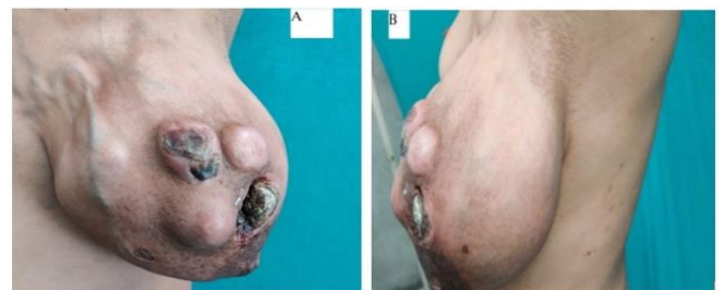
Figure 1: Pre-treatment clinical photograph showing hugely enlarged left breast mass having nodular pattern with necrosis in some places (nipple intact) and overlying prominent, tortuous superficial veins; (A) front view, (B) left lateral view.

General physical and systemic examination was normal. Local examination revealed 12.0 × 10.0 cm growth involving all four quadrants of left breast which was ulcerative, firm, non-tender with retracted nipple (figure 1). In right axillary region there was presence of 2.0 × 2.0 cm single, firm, immobile, non-tender lymph node.