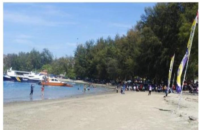
Picture 1. Bolihutuo Beach

At the time of the trip, visitors will pass through the green scenery of Boalemo Regency accompanied by cool air and hilly valleys. Palm trees are scattered among green hilly terrain and line the beach, giving these 38 areas a calm and relaxed atmosphere. This is a great place to come if looking for relaxation and a break from the hectic routine of everyday city life.